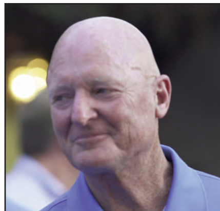
A winning form.