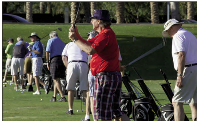
Get a Lesson!