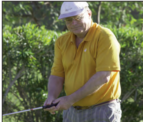
Go in, go in...