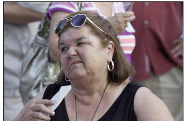
UGH . . .