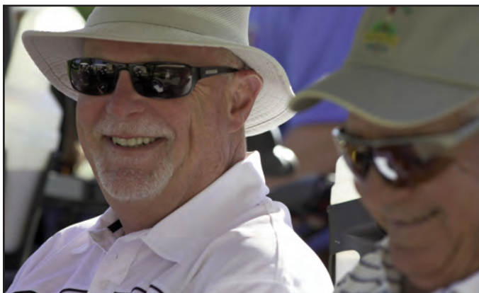
Living the life...