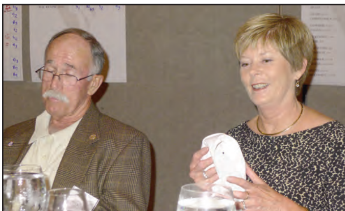
Yes dear it's almost over...