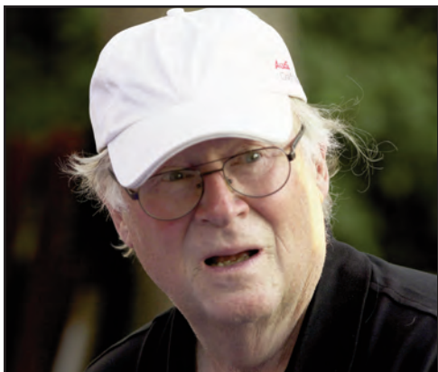
I did not 4 putt!