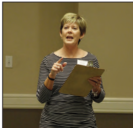
Let's Boggie, have fun!