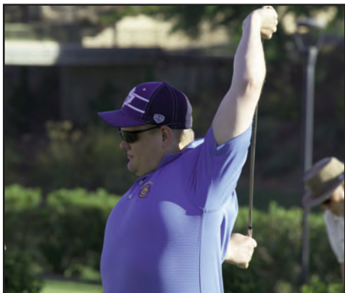
This doesn't hurt, SURE!!!